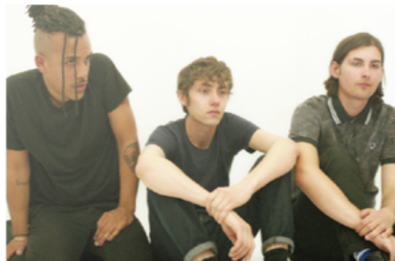
THE BILINDA BUTCHERS ザ・ビルンダ・ブッチャーズ

ezv ♥ : “It’s awesome to be able to work together again!”