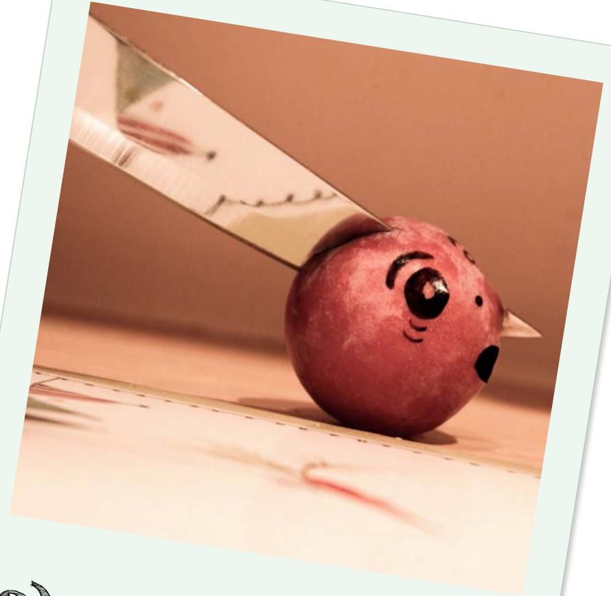
Photo interview with the band